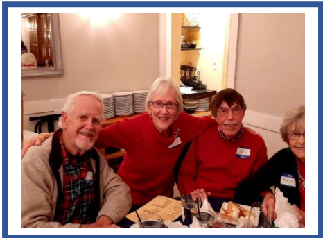
Members and guests enjoying the Holiday Party at Bare Bones restaurant.