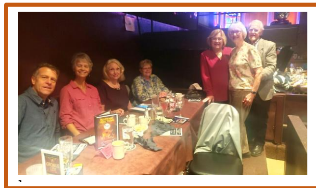
Right and above right, views of members at Toby's Dinner Theater attending a performance of "Sister Act."