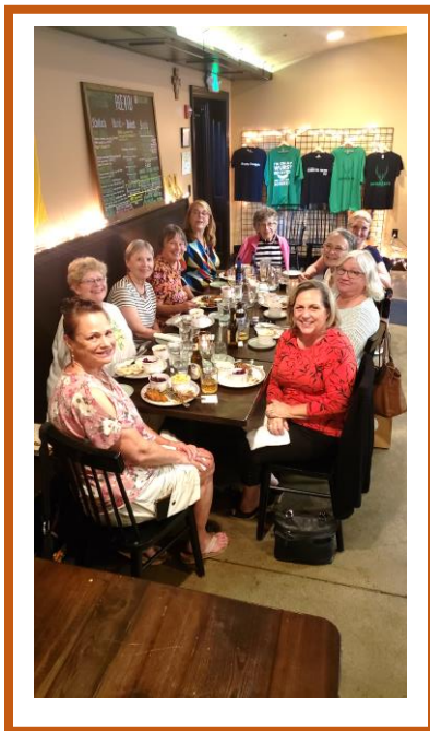
The Adventures in Dining group enjoying themselves at The Rathskeller.