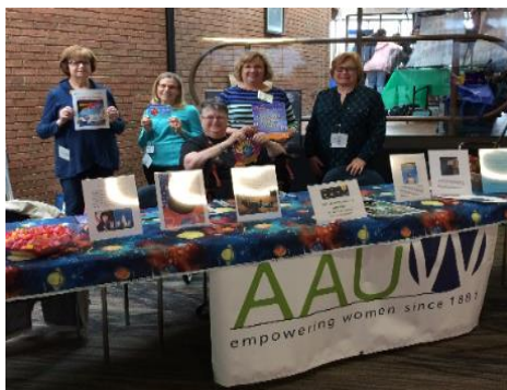
Girl Power STEM Career Fair