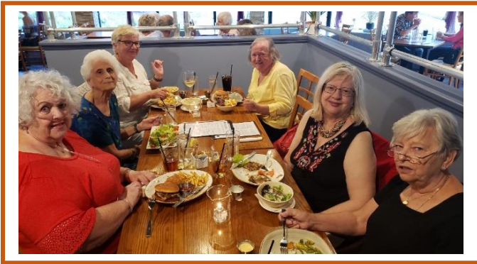
Adventures in Dining Interest Group