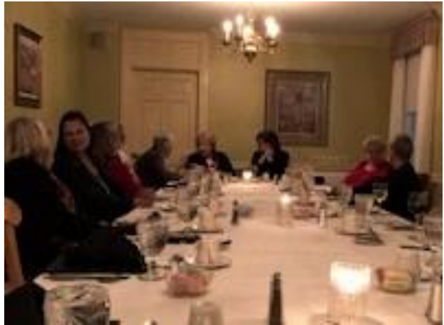
Conversations over a fine meal