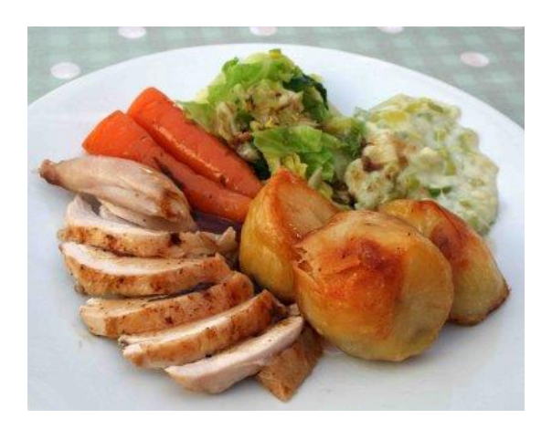
Chicken, ham, rolls and beverages will be furnished by AAUW – Howard County Branch

A short branch business meeting will follow dinner.