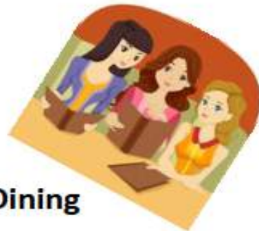
Lunch Bunch Adventures in Dining