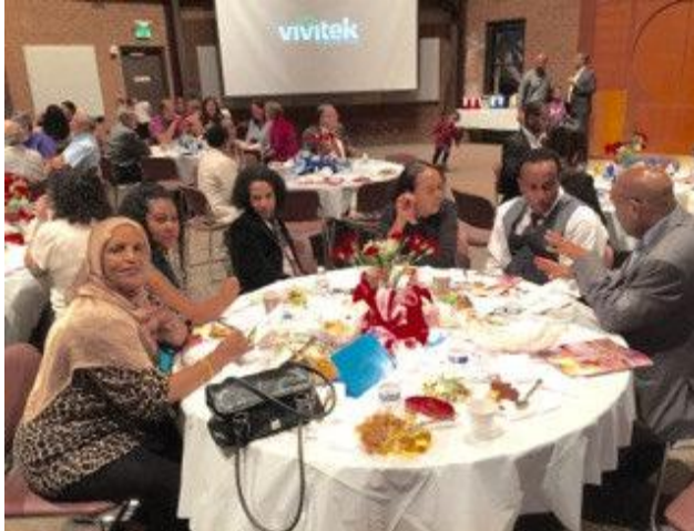
Guests enjoying the evening.