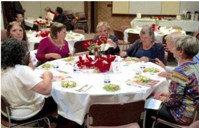
Many AAUW members and friends attended.