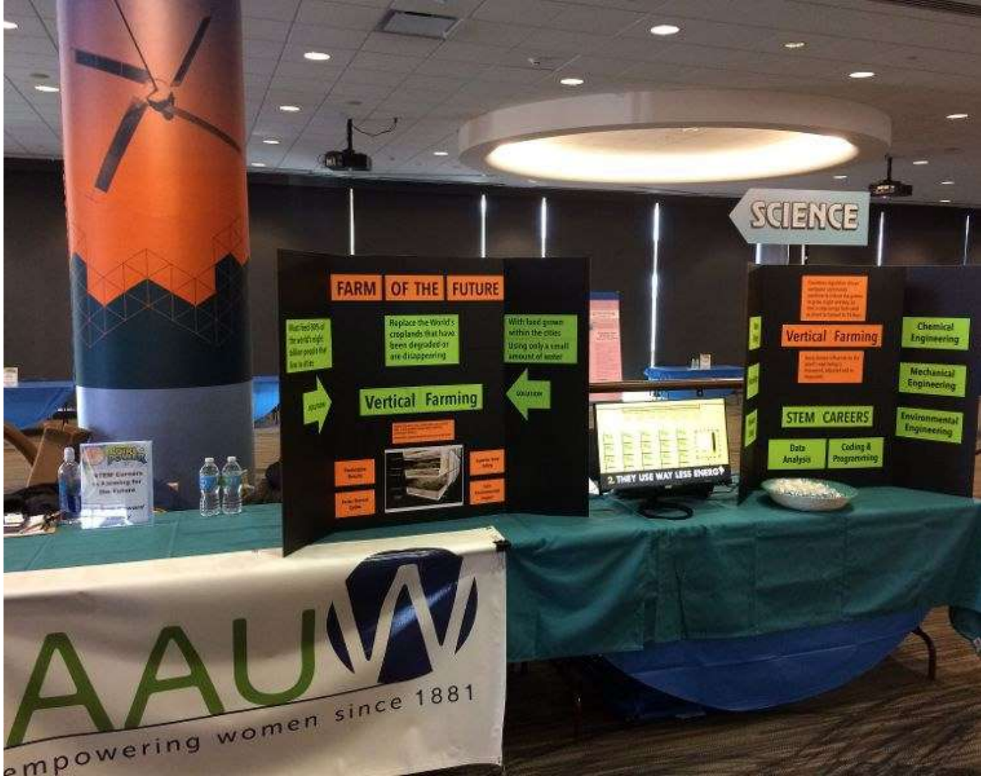
AAUW Table – featuring Vertical Farming information