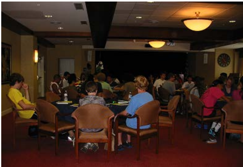
Students practice taking the SAT during an AAUW session