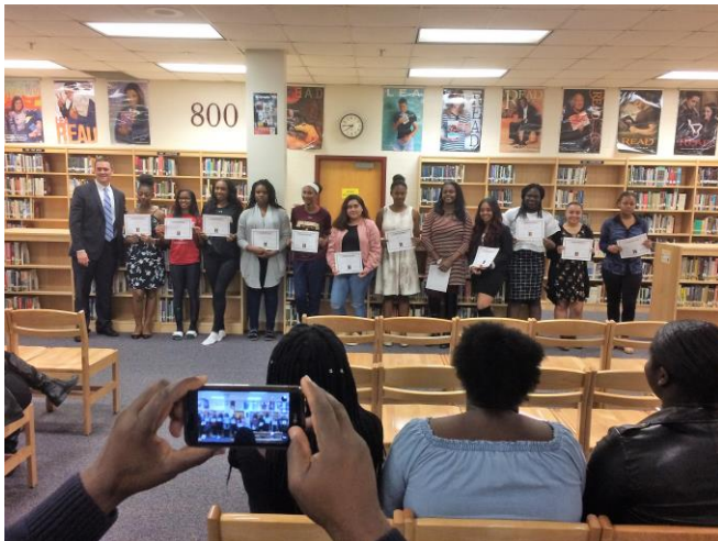
DIAMONDS Induction Ceremony